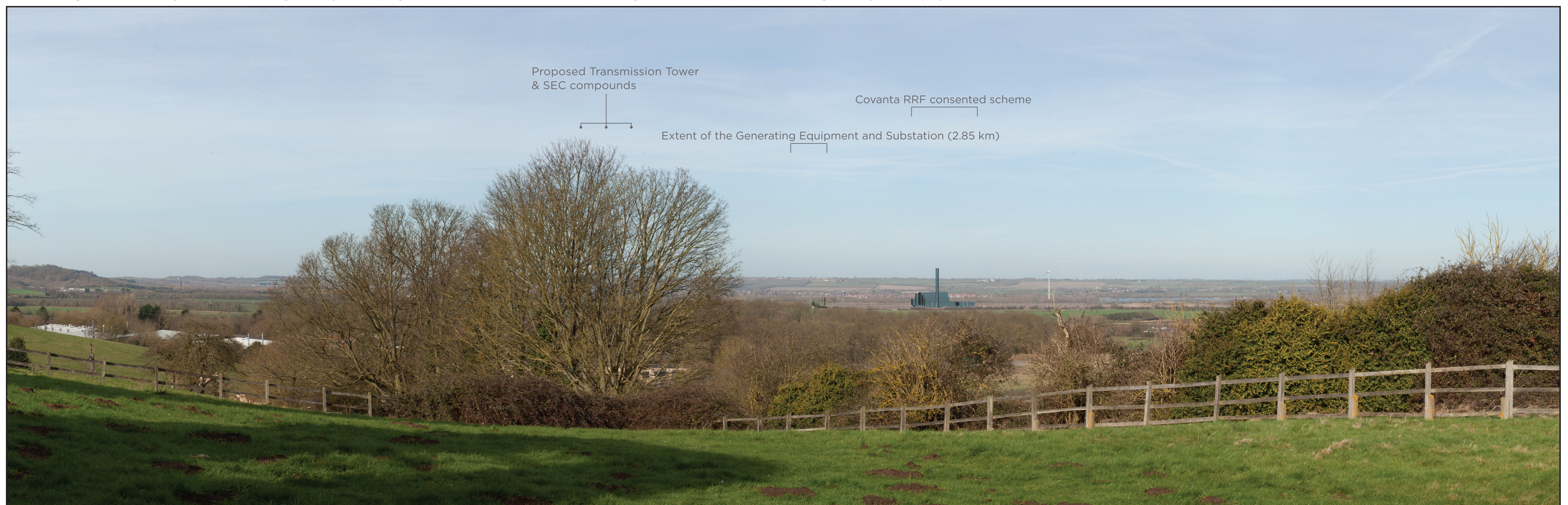
Photomontage view from Houghton House showing the Project. (72 degrees horizontal field of view, 64 cm viewing distance). View direction 293 degrees. (Cylindrical projection).

Proposed Transmission Tower & SEC compounds